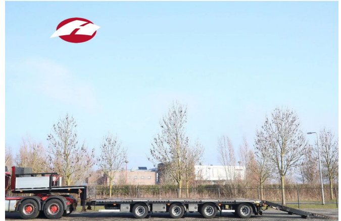
Istrail 4-AXLE SEMI-TRAILER | HYDR RAMPS | HYDR WID...