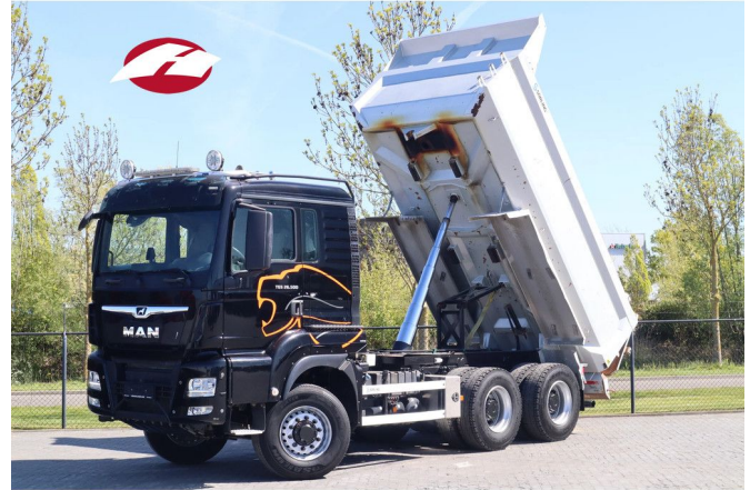
MAN TGS 26.500 | 6X6 | BIG AXLES | EURO 6