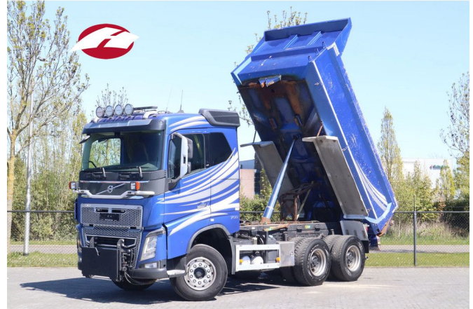
Volvo FH 16.750 | 6X4 | RETARDER | BIG AXLES | EURO 6