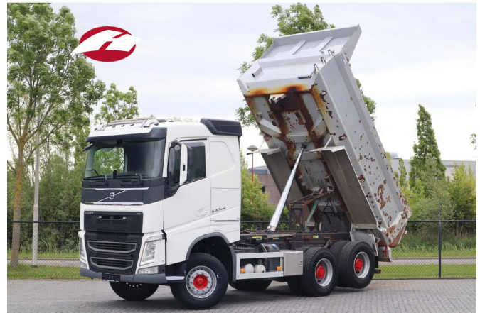
Volvo FH 540 | 6X4 | TANDEMLIFT | RETARDER | BIG AXL...