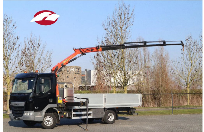
DAF LF 210 4X2 | 48.000 KM | PALFINGER PK5001 | REMOTE