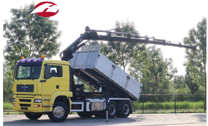
MAN TGA 33.480 | 6X4 | HIAB 166E-5 | KIPPER | HUB RED...