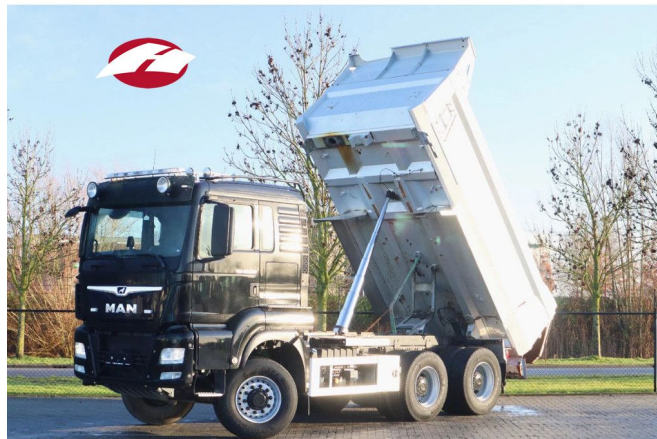
MAN TGS 26.500 6X4 | 6X6 | HYDRODRIVE | BIG AXLES | ...