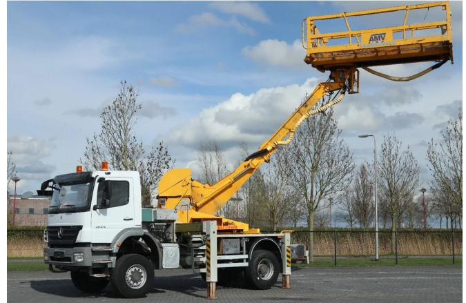
Mercedes-Benz Axor 1829 4X4 EURO 5 MANUAL FULL ST...