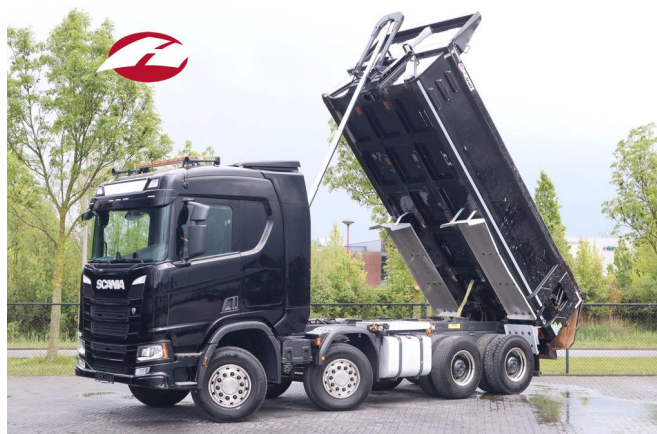
Scania R500 NGS | 8X4 | RETARDER | BIG AXLES | FULL ...