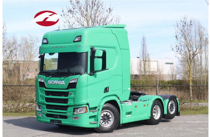
Scania R580 V8 NGS 6X2 | RETARDER | HYDRAULICS | E...