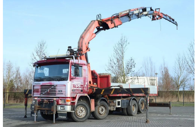
Volvo F 12.400 8X2 FASSI F600XP.24 WITH JIB