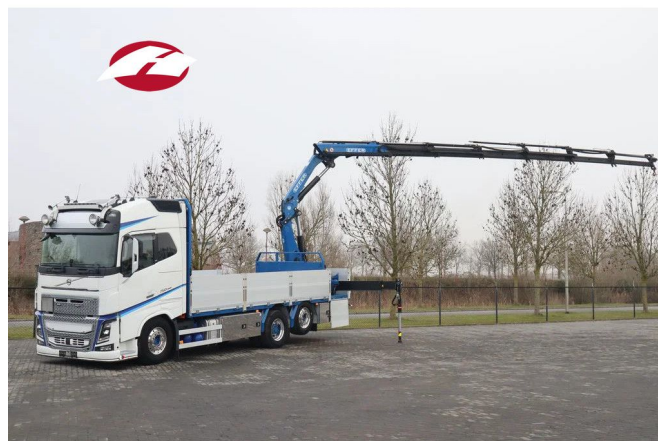
Volvo FH 16.750 | 6X2*4 RETARDER EFFER 215-6 DEMOU...