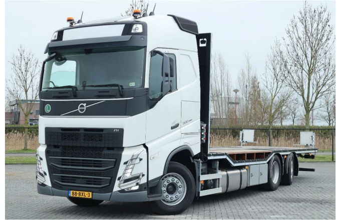
Volvo FH 500 NEW/NEU/ 6X2 STEERING AXLE I-PARK COOL