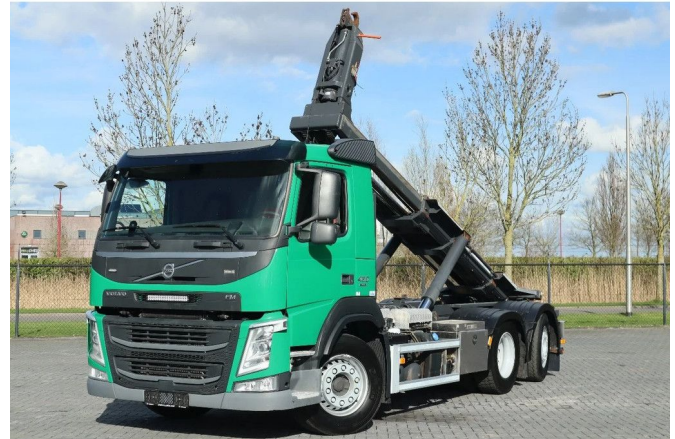
Volvo FM 460 6X2 6X2*4 EURO6 STEERING AXLE HYDRA...