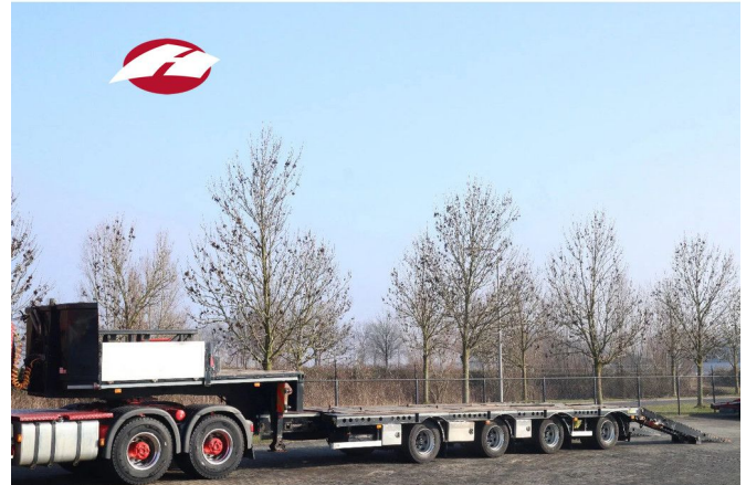
Istrail 4-AXLE SEMI-TRAILER | HYDR RAMPS | HYDR WID...