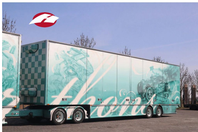
LIMETEC FULL SIDE OPEN TRAILER | 2 AXLE DOLLY | SP...