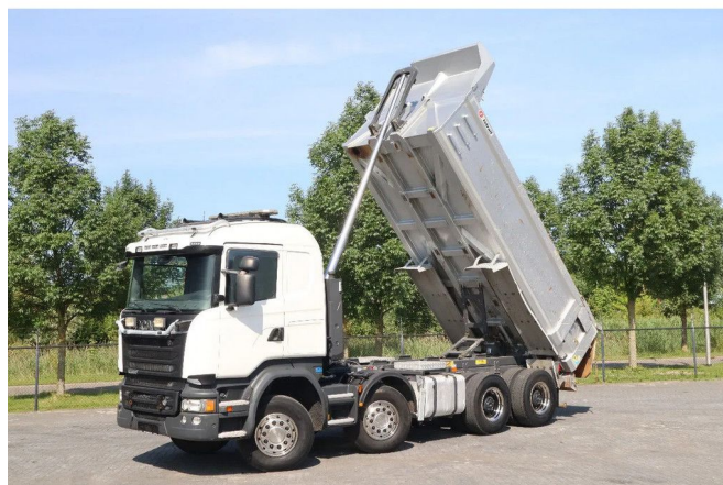
Scania R580 V8 | 8X4 | FULL STEEL | BIG AXLES | RETARD...